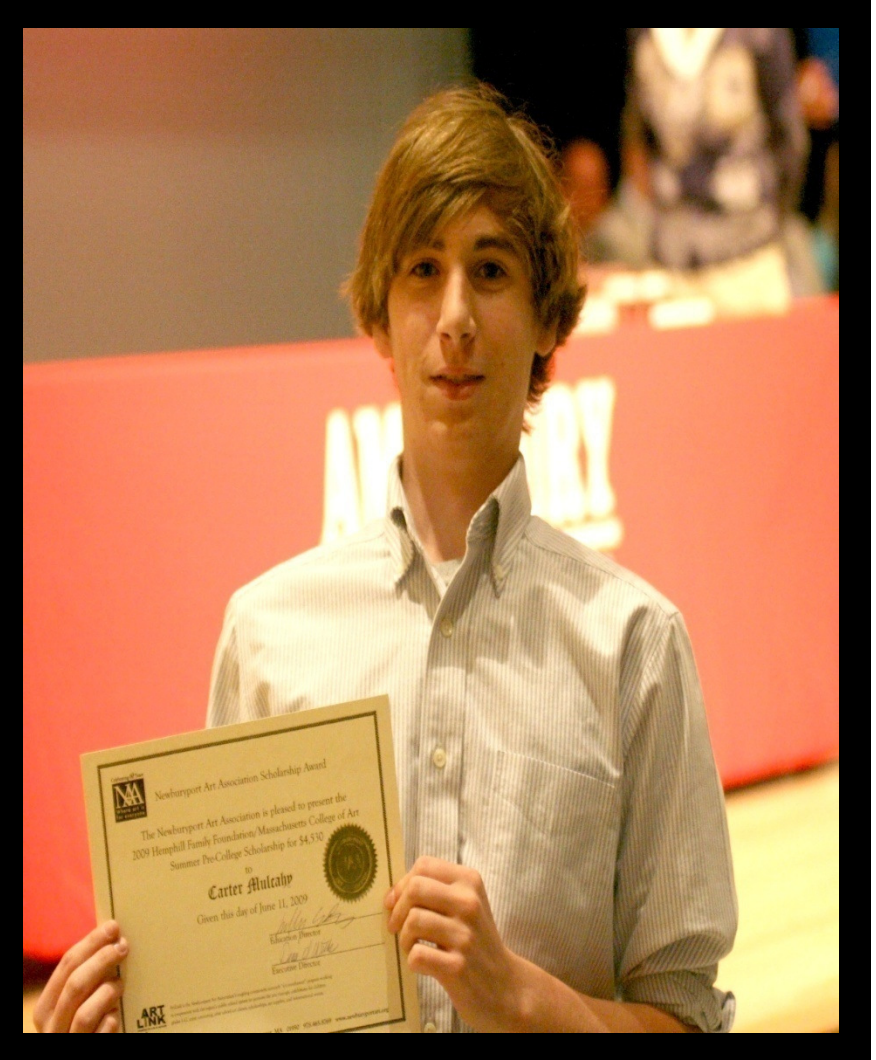
Newburyport Art Association award to Mass College of Art summer program

*Honor Awards Night for students on the Honor Roll * Top 10 Banquet for Seniors *Unsung Student Awards sponsored by the Alumni Association *Book Awards *Athletic Awards *Excellence In Education Awards